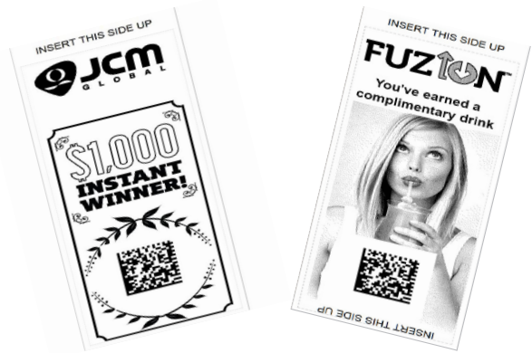
FUZION allows EGMs to redeem 2D barcodes through the iVIZION bill validator.