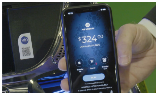
JCM's cashless partnerships give players more transaction options.