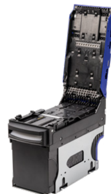
No Compromise in Security

Sealed transport path and high-security features against frauds