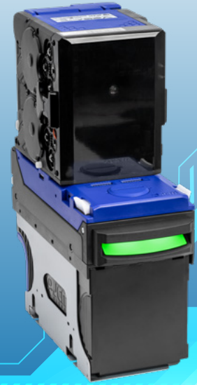
VEGA PRO + RT