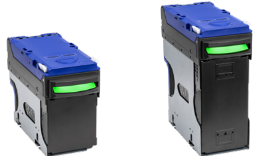
Cash Box Options