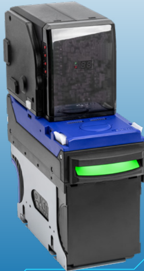
VEGA PRO + RC