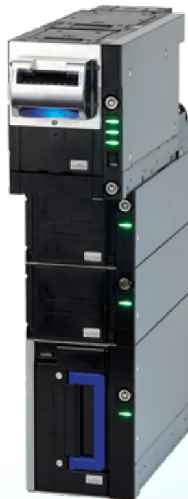
MRX-SNF 2 Recycling Modules Cash Box