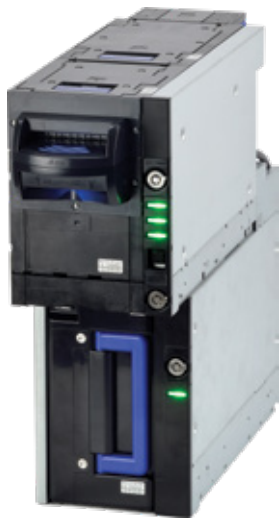
MRX-BNF Cash Box