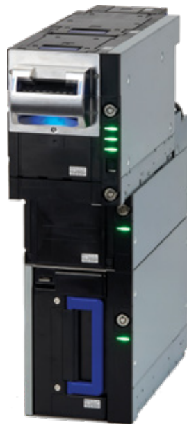
MRX-SNF 1 Recycling Module Cash Box