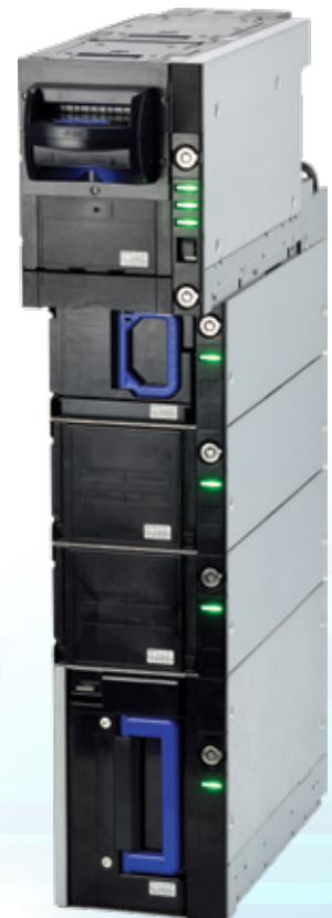
MRX-BNF 1 Loading/Dispensing Module 2 Recycling Modules Cash Box

Configurations above are only examples of what is available