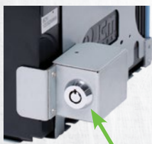
Unit lock option