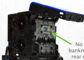
No access to banknotes when the rear cover is open