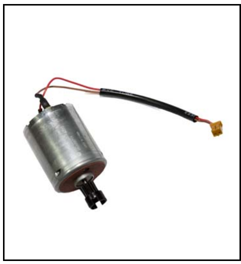
Figure 2: Original UBA Transport Motor EDP# 106441

JCM Global Corporation • 925 Pilot Road • Las Vegas, Nevada 89119 Phone 800-683-7248 or 702-651-0000 • Fax: 702-644-5512 Email: sales@jcmglobal.com