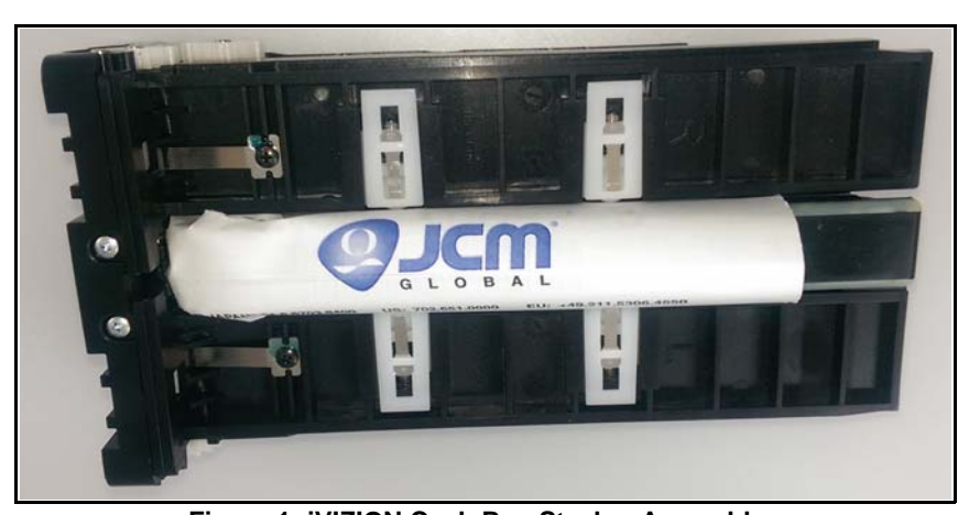
Figure 1: iVIZION Cash Box Stacker Assembly with Ticket Jam (Abnormal)

JCM Engineering has received reports of improperly stacked Tickets in the iVIZION Validator's Cash Box (refer to Figure 1 below). The Ticket's trailing edge may catch on the Stack Guide, moving it to a vertical position. The Stack Guide Spring may also be moved out of position. (Refer to Figure 2 on reverse to view these conditions.)