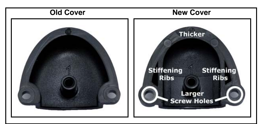
Figure 4: iVIZION Handle Cover (Interior View)

Figure 3: iVIZION Handle Cover (Side View)