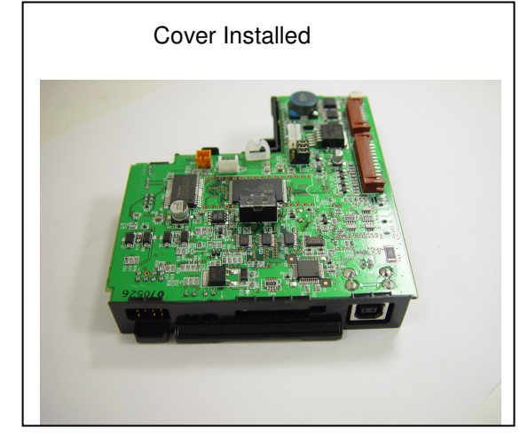
Figure 1 Figure 2