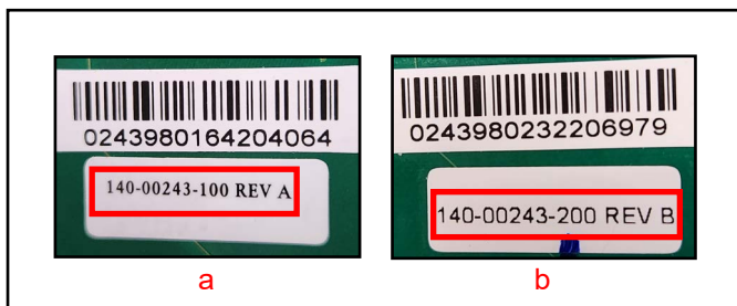
Figure 1 GEN5® CPU Board Part Number Label Samples (REV A / REV B)