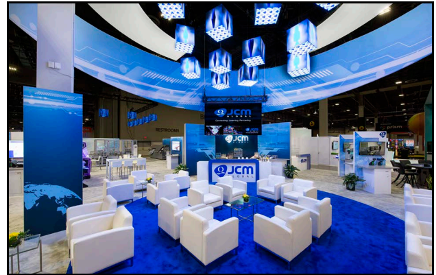
Click Above to Receive a Complimentary Expo Hall Pass to G2E 2022

Table games will be more secure and efficient with JCM's new iVERIFY™ System Technology. Using high-resolution camera and optical recognition technology, iVERIFY tracks and records currency and TITO transactions at live table games by verifying cash buy-in, TITO tickets, and tracks the chip inventory in the tray. JCM will also show CountR's award-winning TITA™ table game solution. A section of JCM's booth will be dedicated to Count Room Automation solutions populated with products from JCM's partner CPS, a world leader in Count-Sort equipment, including CPS' new XM Range™, the V-Series™, 7000i™,