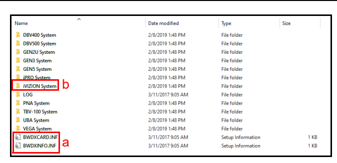
Figure 2: SD Memory Card Root Directory with .INF Files (Required)

For additional information on JCM Products, visit the JCM Global website at www.jcmglobal.com, or contact your local JCM Sales Representative at (800) 683-7248.