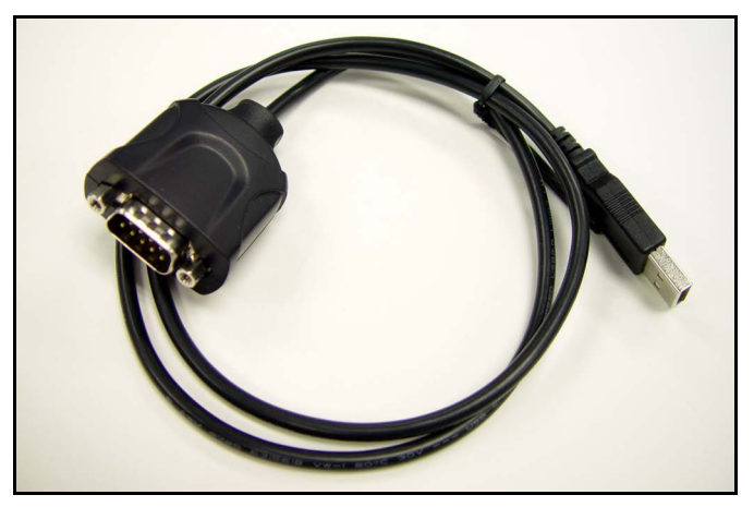
Figure 1 SIIG® USB to Serial Adapter