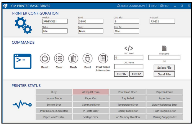
Figure 2 JCM Printer Basic Driver Application User Interface

For additional information on JCM Products, visit the JCM Global website at www.jcmglobal.com, or contact your local JCM Sales Representative at (800) 683-7248.