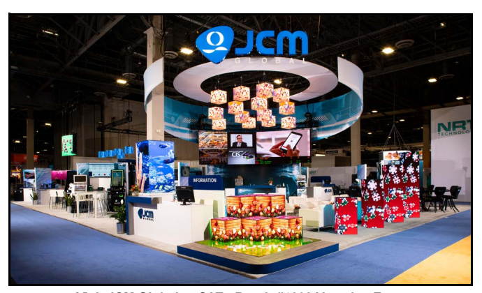
Visit JCM Global at G2E - Booth #4039 Venetian Expo

JCM's latest partnership with Cash Processing Solutions (CPS) dramatically increases efficiencies in the Count Room, with flexible and modular Count-Sort Solutions, including the 7000i^{\text{\tiny M}} , X Range ^{\text{\tiny M}} , V Series ^{\text{\tiny M}} and ECM ^{\text{\tiny M}} enterprise-wide Cash Management software.