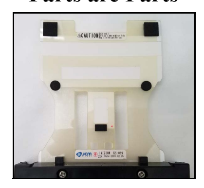
Figure 1 iVIZION® Calibration Reference Paper KS-089