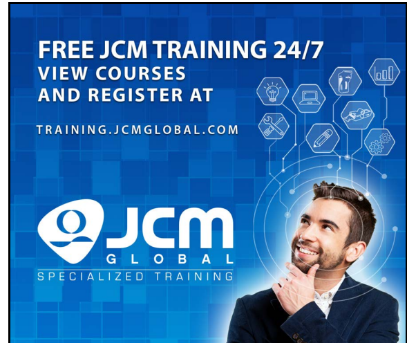
Figure 2 JCM Online Training

For information about other JCM Products, visit the JCM Global website at www.jcmglobal.com , or contact your local JCM Sales Representative at (800) 683-7248.