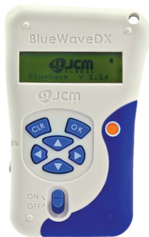
Figure 1 BlueWave™DX Tool