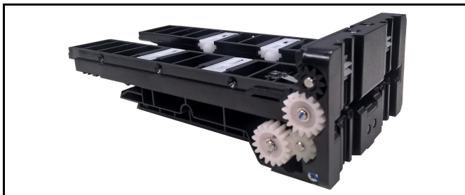
Figure 1 iVIZION® Pusher Mechanism (P/N 197878)