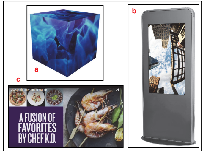
Figure 2: PIXELPRO CUBE (a), Partner Display (b), JCMedia Content (c)

For additional information on JCM Products, visit the JCM Global website at www.jcmglobal.com or contact your local JCM Sales Representative at (800) 683-7248.