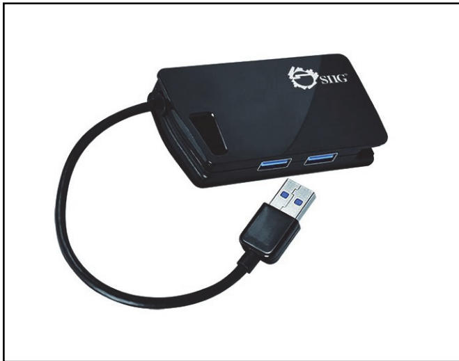
Figure 1 SIIG® 4 Port Hub (P/N JU-H30812-S1)