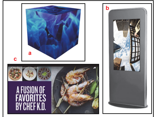
Figure 2: PIXELPRO CUBE (a), Partner Display (b), JCMedia Content (c)

For additional information on JCM Products, visit the JCM Global website at www.jcmglobal.com , or contact your local JCM Sales Representative at (800) 683-7248.