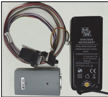
Figure 1 UAC Kit for iVIZION and TBV Components (P/N 701-100112R)