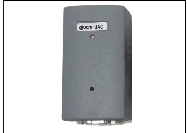
Figure 2 Universal Adapter for Communications (UAC) Module

For additional information on JCM Products, visit the JCM Global website at www.jcmglobal.com , or contact your local JCM Sales Representative at (800) 683-7248.