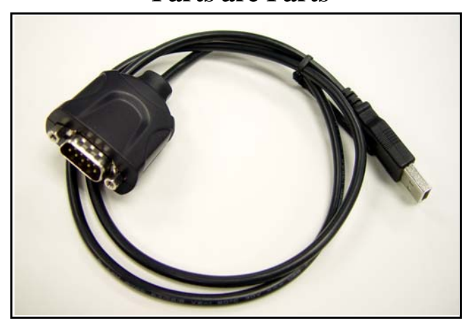
Figure 1: SIIG USB-to-Serial Adapter