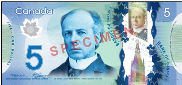
Figure 2: Canadian Polymer $5.00 Bill (Front) (SPECIMEN-NOT VALID FOR LEGAL TENDER)