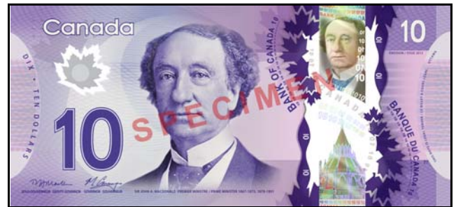
Figure 3: Canadian Polymer $10.00 Bill (Front) (SPECIMEN-NOT VALID FOR LEGAL TENDER)