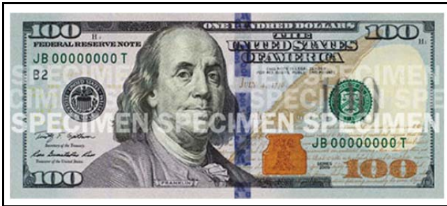
Figure 2: U.S. NexGen $100.00 Bill (Front) (SPECIMEN-NOT VALID FOR LEGAL TENDER)