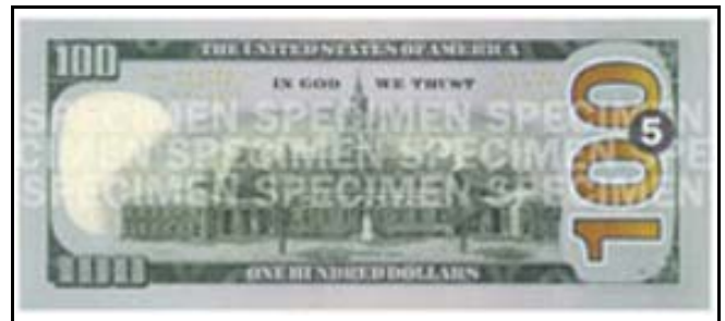
Figure 3: U.S. NexGen $100.00 Bill (Back) (SPECIMEN-NOT VALID FOR LEGAL TENDER)