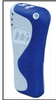
Figure 2: JCM BlueWave™2.0 Download Tool (P/N 550-100720R)