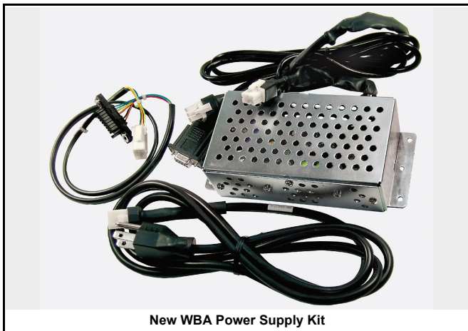
New WBA Power Supply Kit