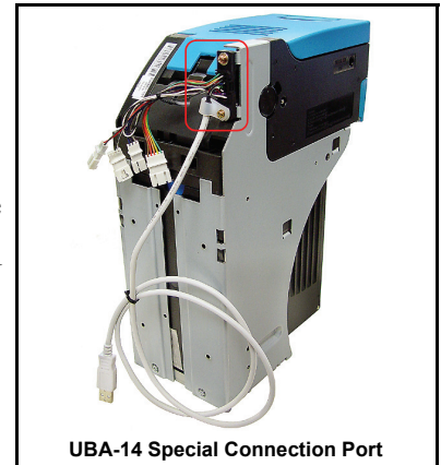
UBA-14 Special Connection Port

Contact your local JCM sales representative for additional product information.