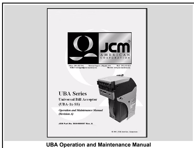
UBA Operation and Maintenance Manual