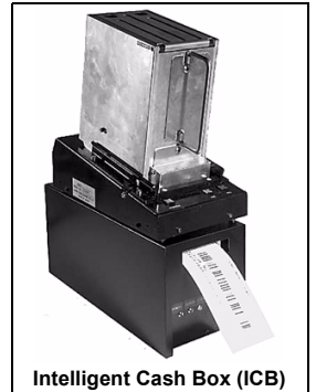
Intelligent Cash Box (ICB)

Answer: The Intelligent Cash Box (ICB) system was developed to help prevent variance errors created during drop and soft count procedures. Most variance errors are caused by metering system malfunctions or by human errors in identifying which Cash Box is assigned to a specific machine in the soft count room depending on the system being used (i.e., numbered Cash Boxes, bar coded Cash Boxes, dolphin barcode readers, etc.).